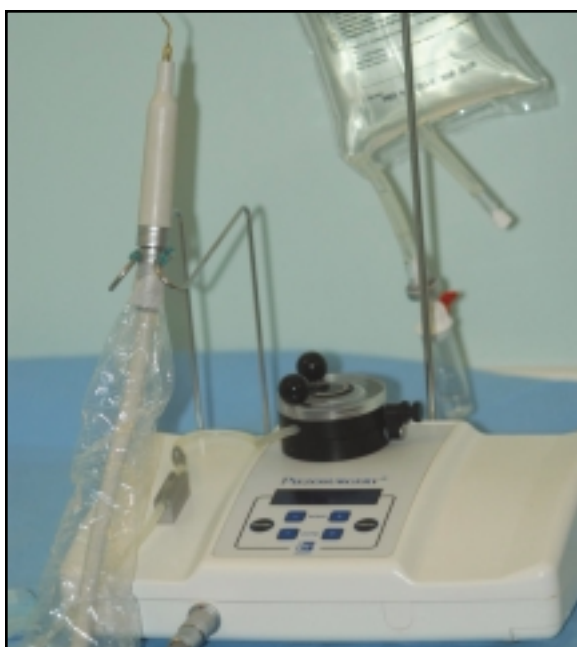
Fig. 1 Mectron Piezosurgery device.

This article presents an alternative method that uses piezoelectricity to minimize trauma to the impacted tooth and the surrounding tissues. The Mectron Piezosurgery* device contains a powerful piezoelectric handpiece with a functional frequency of 25-29kHz and a digital modulation capability of 30Hz 11-14 (Fig. 1). It improves surgical control by performing a precise, selective cut, using ultrasonic waves transmitted to the hard tissues through an insert mounted on the handpiece. The inserts vibrate linearly between 60 and 210 microns, providing the handpiece with power in excess of 5W (Fig. 2). A