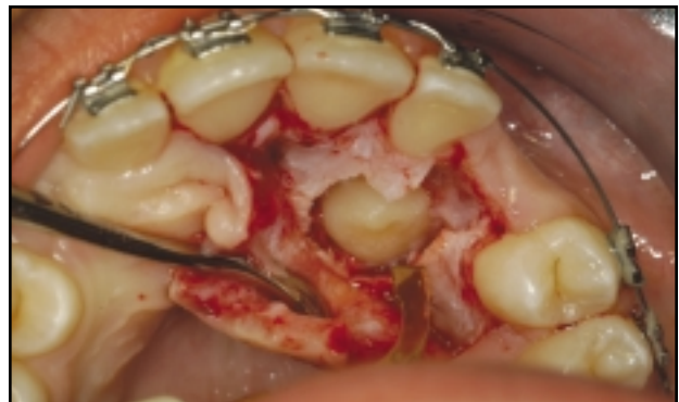
Fig. 6 Channel formed through alveolar bone using OT2 insert.