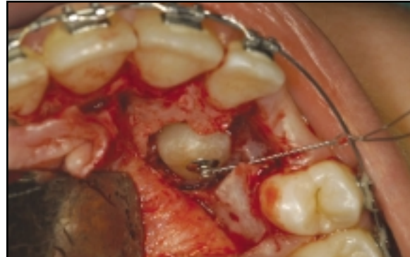
Fig. 7 Bracket bonded to exposed canine crown.