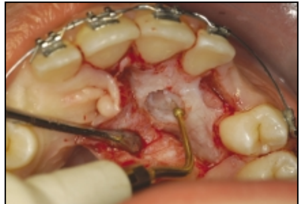
Fig. 4 Removal of bone over impacted canine using OT5 insert.