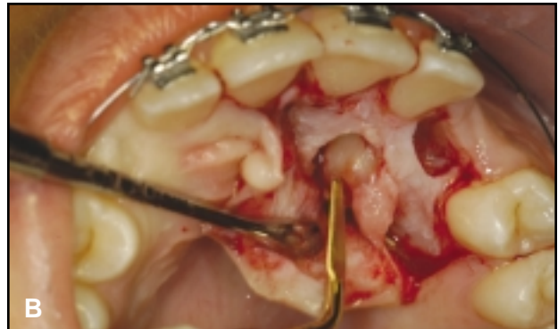
Fig. 5 A. Exposure of impacted canine crown using EX1 insert. B. Removal of follicle.