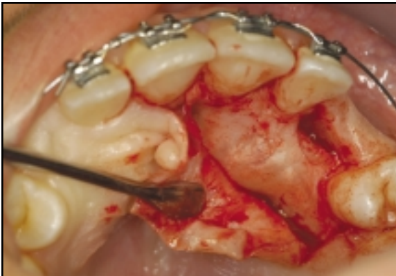
Fig. 3 Elevation of mucoperiosteal flap.